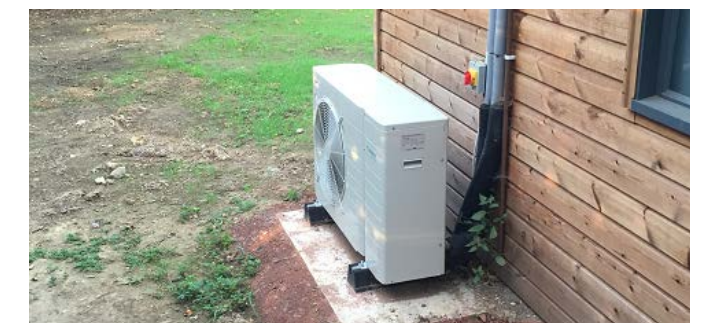
Figure 4 - An air-source heat pump at The Montessori School (BHESCO, 2019a)

Measures to improve energy efficiency include double and secondary glazing; light technologies such as chimney balloons, radiator reflectors, LED light bulbs (Figure 5); energy efficient refrigerators, insulation foam, loft insulation, infrared heating and under-floor heating.