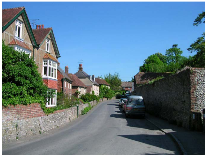
Figure 7: Firle, East Sussex, England

Another major project with which BHESCO is currently involved is a district-heating scheme for the village of Firle, some 13 miles from Brighton (Figure 7). This would be a large-scale initiative. The village consists of "81 properties, a pub, a church, a brewery, a grocery store, a village hall and an estate office" (BHESCO, 2019c). The plan is to supply heat to the village by heating zone, with several heat networks powered by heat pumps driven by a solar PV plant. The system would replace existing costly and environmentally damaging kerosene oil heating systems, which currently heat most properties in the village. The plan will make "Firle ... the first village in the country to go fossil fuel free" (BHESCO, 2019c). The estimated cost of the project is about £3.5 million (125).