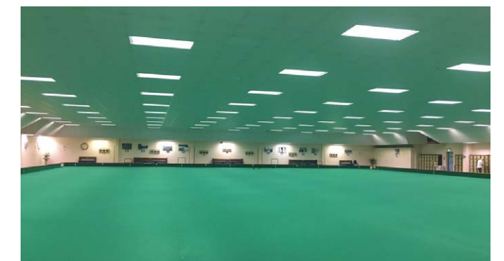
Figure 5 - LED lights installed in a bowling club (BHESCO, 2019a)

Because of its deployment of such a wide range of technologies, singular technologies are of less importance to the business than is evident with other community energy initiatives. BHESCO's 2018 share offer document explains: