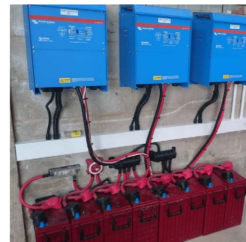
Figure 3 – Battery storage at a Golf Club (Curtis, 2018a, 2018b)

To generate heat, it has installed air-source heat pumps (Figure 4). BHESCO has also been a first-mover with regard to installing SunAmp's phase-change thermal storage technology (Sunamp, 2019), which utilises similar chemical storage technology to that employed in hand-warmers. It stores heat from surplus electricity generated from solar PV and transfers this to water when it is demanded by the consumer (Fully Charged, 2019).